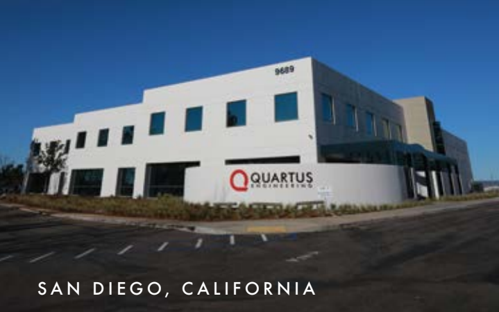
SAN DIEGO, CALIFORNIA